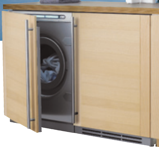
UltraCare Fully Integrated Laundry System